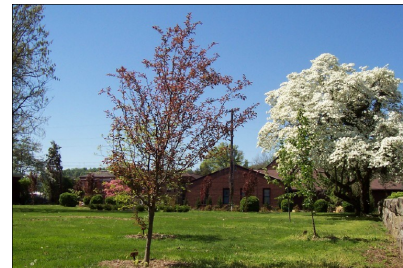
3- French Art Colony