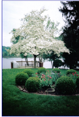
5- Home of Beth Cherrington