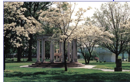
1- Gallipolis City Park