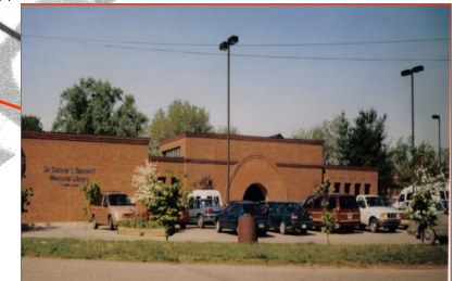
5-Bossard Memorial Library