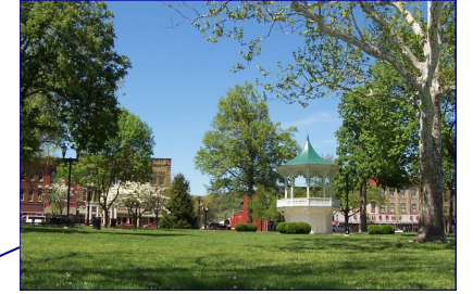
Gallipolis City Park