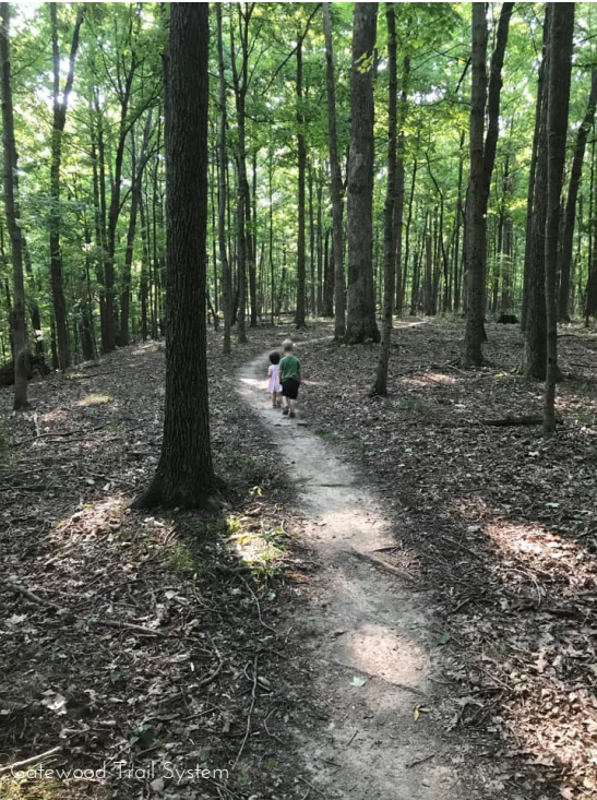
Gatewood Trail System

The 11,119-acre Crown City Wildlife Area, located in portions of Lawrence and Gallia counties, is situated in southern Ohio approximately 3 miles south of Mercerville. The primary access to the wildlife area is from State Route 218 and State Route 790. Crown City Wildlife Area is located in the unglaciated region of southern Ohio. The terrain, dissected by numerous small streams, is rolling to rugged. Crown City Wildlife Area is a popular destination for hunting, fishing, trapping, and other forms of wildlife recreation. Scattered ponds which were created through the reclamation process provide fishing prospects for anglers. To the extreme southeast of the wildlife area is a 360-acre parcel that provides access to the Ohio River for additional fishing opportunities and waterfowl hunting.